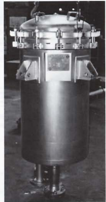
Sparkler Reverse Flow Horizontal Plate Filter Model RF18